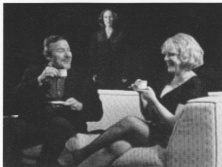
Old Times

Rollins Theatre of The Long Center for the Performing Arts