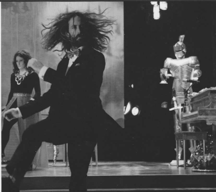
Stop Hitting Yourself at Lincoln Center Theater (NYC)

Go to www.rudemechs.com/off_center to find out what's playing.