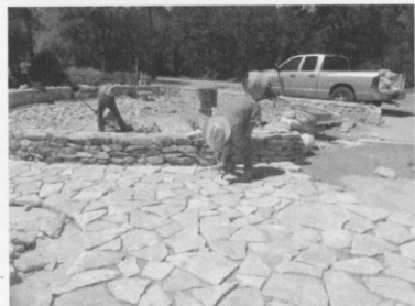
Construction progress early April.