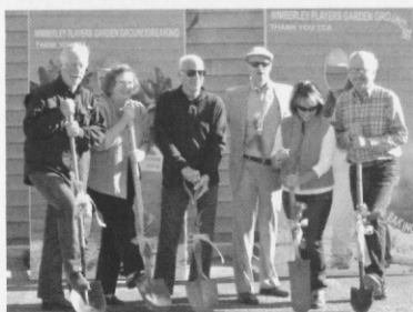
Groundbreaking March 4.